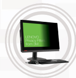
Lenovo Privacy Filter for ThinkCentre AIO from 3M