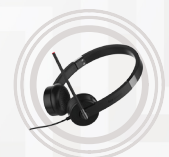
Lenovo Stereo Headset