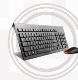
Lenovo Professional Wireless Combo